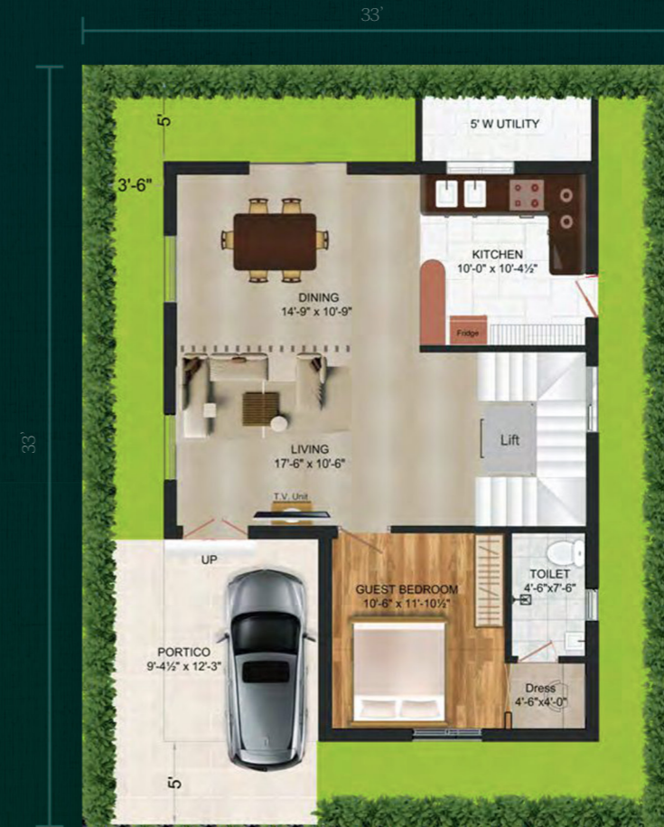
30' WIDE EAST ROAD GROUND FLOOR