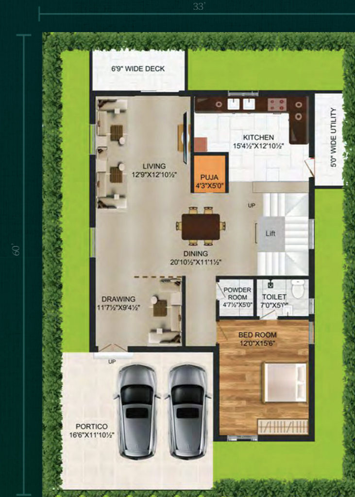
30' WIDE EAST ROAD GROUND FLOOR