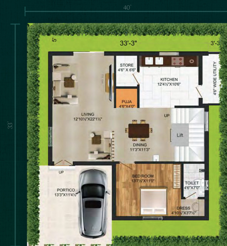
40' WIDE EAST ROAD