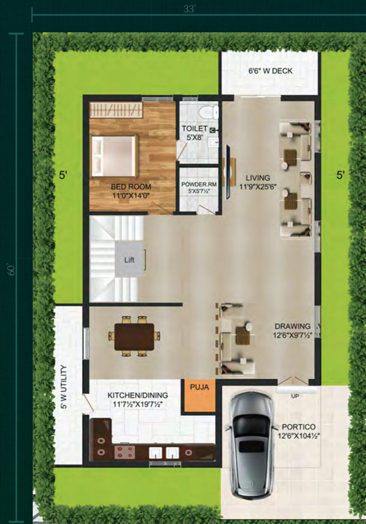
30' WIDE EAST ROAD GROUND FLOOR