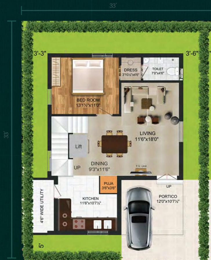
30' WIDE EAST ROAD GROUND FLOOR